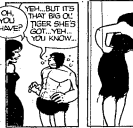
OH, YOU HAVEN? YEH... BUT IT'S THAT BIG OL' TIGER SHE'S GOT. YEH, YOU KNOW...