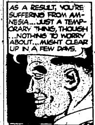
AS A RESULT, YOU'RE SUFFERING FROM AMNESIA... LIST A TEMPORARY LIST, THOUGH... NOTHING TO WORRY ABOUT... MIGHT CLEAR UP IN A FEW DAYS.