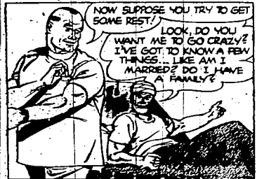
NOW SUPPOSE YOU TRY TO GET SOME REST! LOOK, DO YOU WANT ME TO GO CRAZY? I'VE GOT TO KNOW A FEW THINGS... LIKE AM I MARRIED? DO I HAVE A FAMILY?