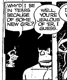
WHY'D I BE IN TEARS BECAUSE OF SOME NEW GIRL?