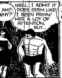
WELL, YOU'RE JEALOUS OF 'ER, I GUESS.