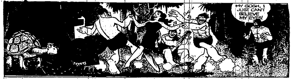
MY GOSH, I JUST CAN'T BELIEVE MY EYES!