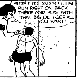
SURE I DO. AND YOU JUST RUN RIGHT ON BACK THERE AND PLAY WITH THAT BIG OL' TIGER ALL YOU WANT!