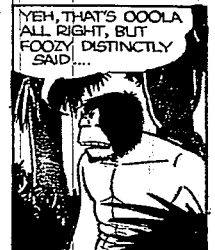
YEH, THAT'S OOOOLA ALL RIGHT, BUT FOOZY DISTINCTLY SAID...