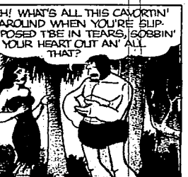
YEH! WHAT'S ALL THIS CA'ORTIN' AROUND WHEN YOU'RE SLIP-POSED T'BE IN TEARS, SOBBIN' YOUR HEART OUT AN' ALL THAT?