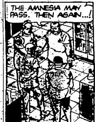
THE AMNESIA MAY PASS, THEN AGAIN...