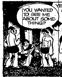
YOU WANTED TO SEE ME ABOUT SOMETHING?