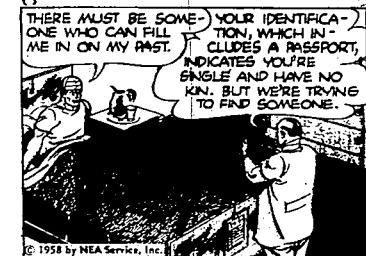
THERE MUST BE SOMEONE WHO CAN FILL ME IN ON MY PAST. YOUR IDENTIFICATION, WHICH INDICATES YOU'RE SINGLE AND HAVE NO KIN, BUT WE'RE TRYING TO FIND SOMEONE.