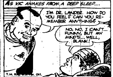
AS VIC AWAKES FROM A DEEP SLEEP... I'M DR. LANDER. HOW DO YOU FEEL? CAN YOU REMEMBER ANYTHING?

NO, NO, I CAN'T... FUNNY, BUT MY MIND'S... WELL, BLANK!